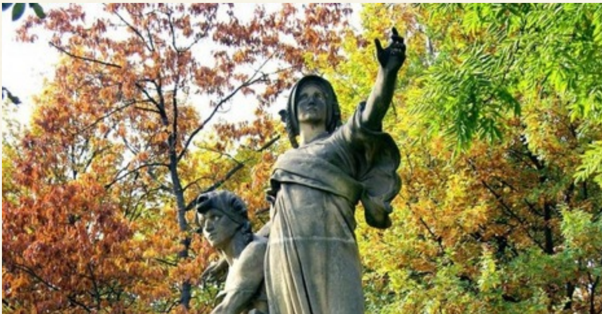
Statute of Přemysl and Libuše, Vyšehrad

If you will find time to go to Vyšehrad, just several hundred meters from our Congress Centre, you will see not only this mysterious place important for this country, but also the statues of Přemysl and Libuše and a view in which Libuše saw Prague and you will see it with your own eyes at 42 meters high above the Vltava River around 3 km south-east of Prague Castle.