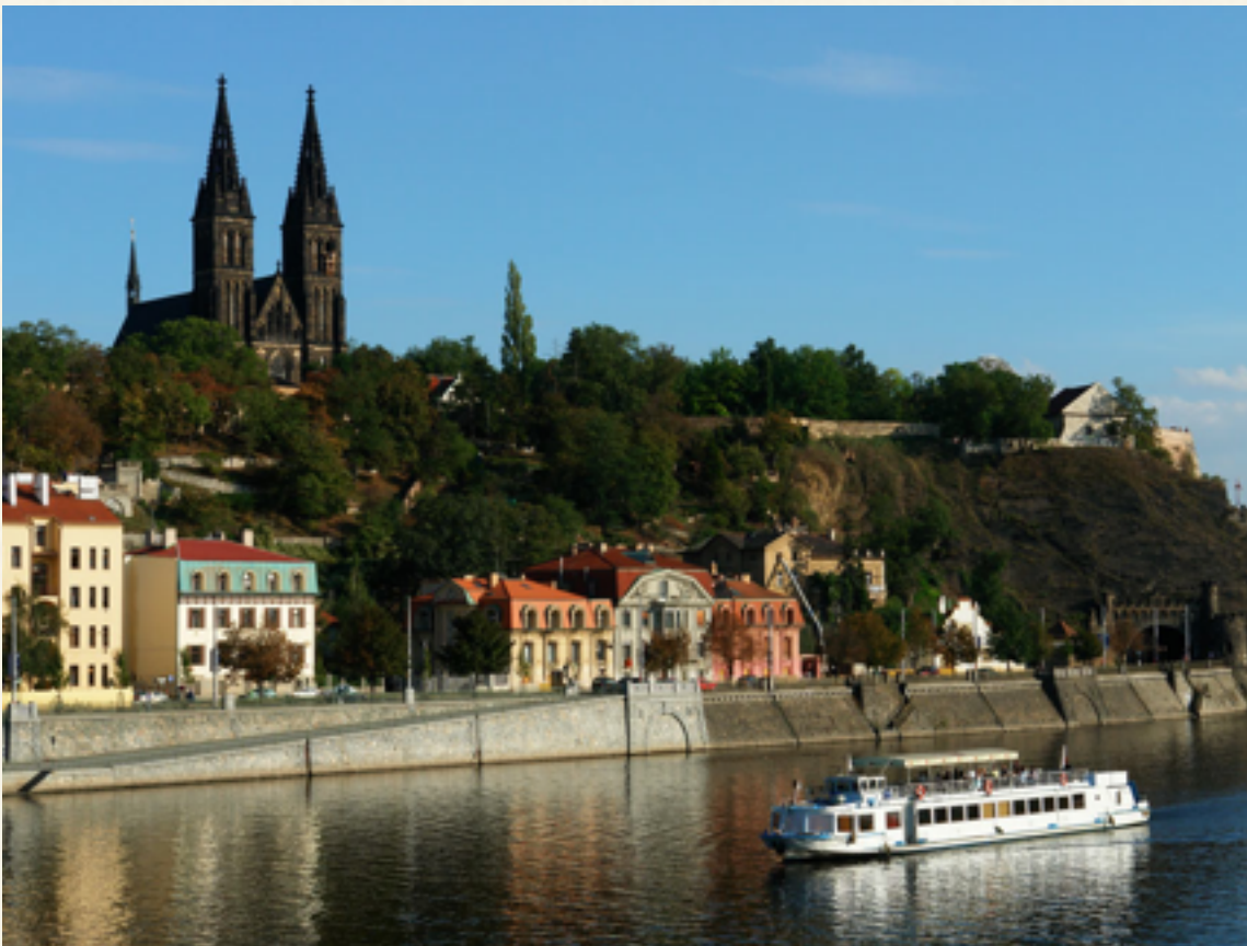
Vyšehrad and Basilica of St. Peter and St. Paul

Another way how to encourage specialists to join ISPRS is to address them personally during ISPRS and non-ISPRS meetings. This activity is performed by all Council members, Technical Commission Presidents and all organizers of ISPRS workshops.